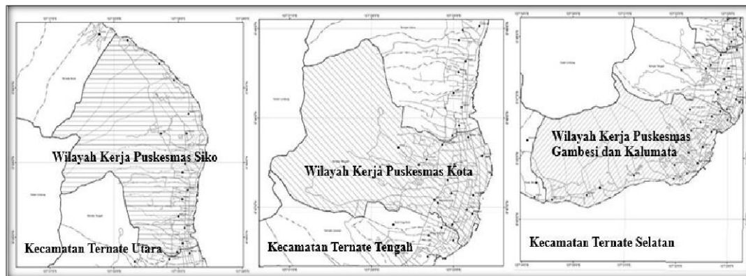
Fig 1. The Working Areas of Gambesi, Kalumata, Kota and Siko Health Centers.

This research used descriptive method with laboratory test. this research was conducted from September to December 2021. This research consists of two stages: First; egg collection in four Community Health Centers' working areas in Ternate City (Community Health Center in Gambesi, Kalumata, Kota and Siko). (Figure 1) Second; Egg rearing, identification of types of mosquitoes and virus detection using the RT-PCR method at the Microbiology Laboratory of Health Research and Development Office ( Balai LITBANGKES ) in Banjarnegara.